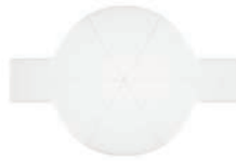
Fully Upholstered Hub, Two Linking Ends, 180° dia 60 ext 15