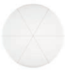
Fully Upholstered Pod dia 54