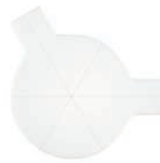
Fully Upholstered Hub, Two Linking Ends, 240° dia 60 ext 15