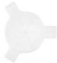
Fully Upholstered Hub, Three Linking Ends dia 60 ext 15