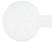
Fully Upholstered Hub, One Linking End dia 60 ext 15